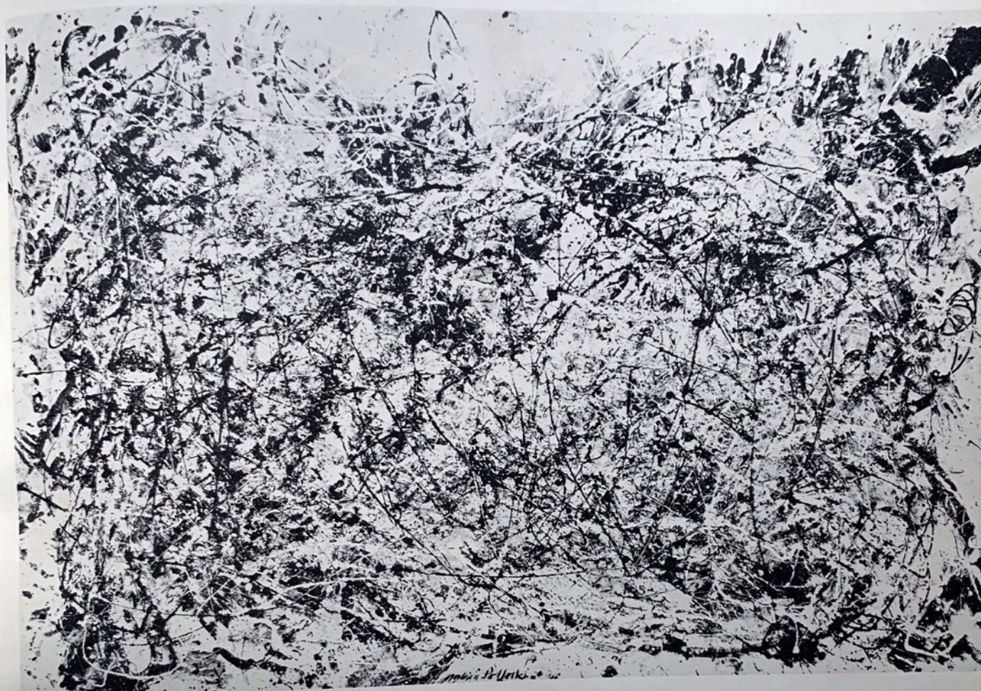
Figure 6 JACKSON POLLOCK