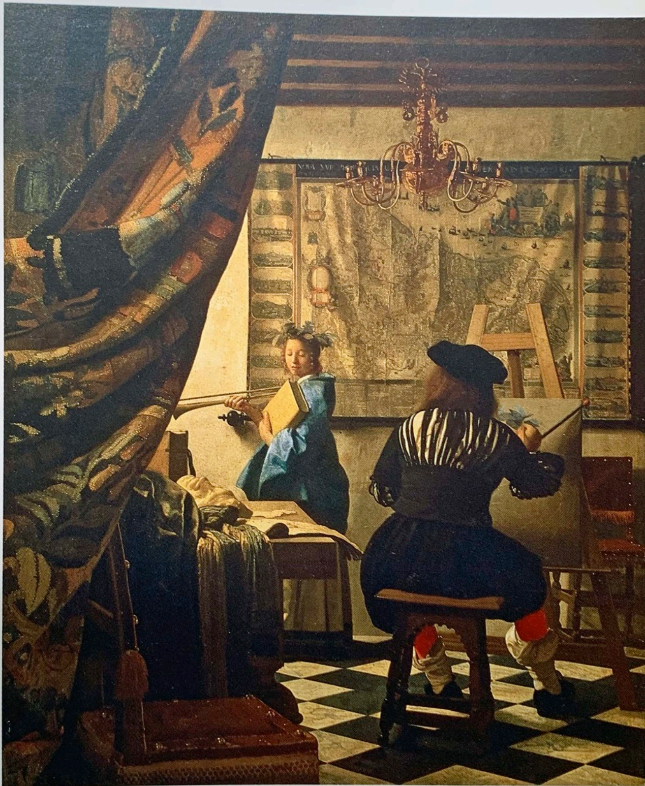
Plate I VERMEER