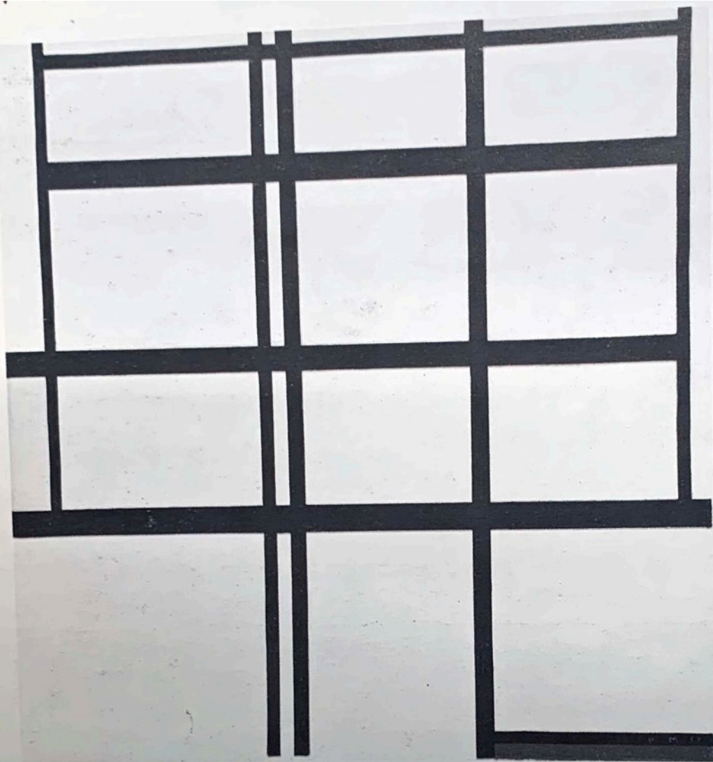
Figure 5 PIET MONDRIAN Composition in Yellow, Blue, and White, I (1937) Oil on canvas, 22\frac{1}{2} \times 21\frac{3}{4} in. Gift to The Museum of Modern Art, New York The Sidney and Harriet Janis Collection