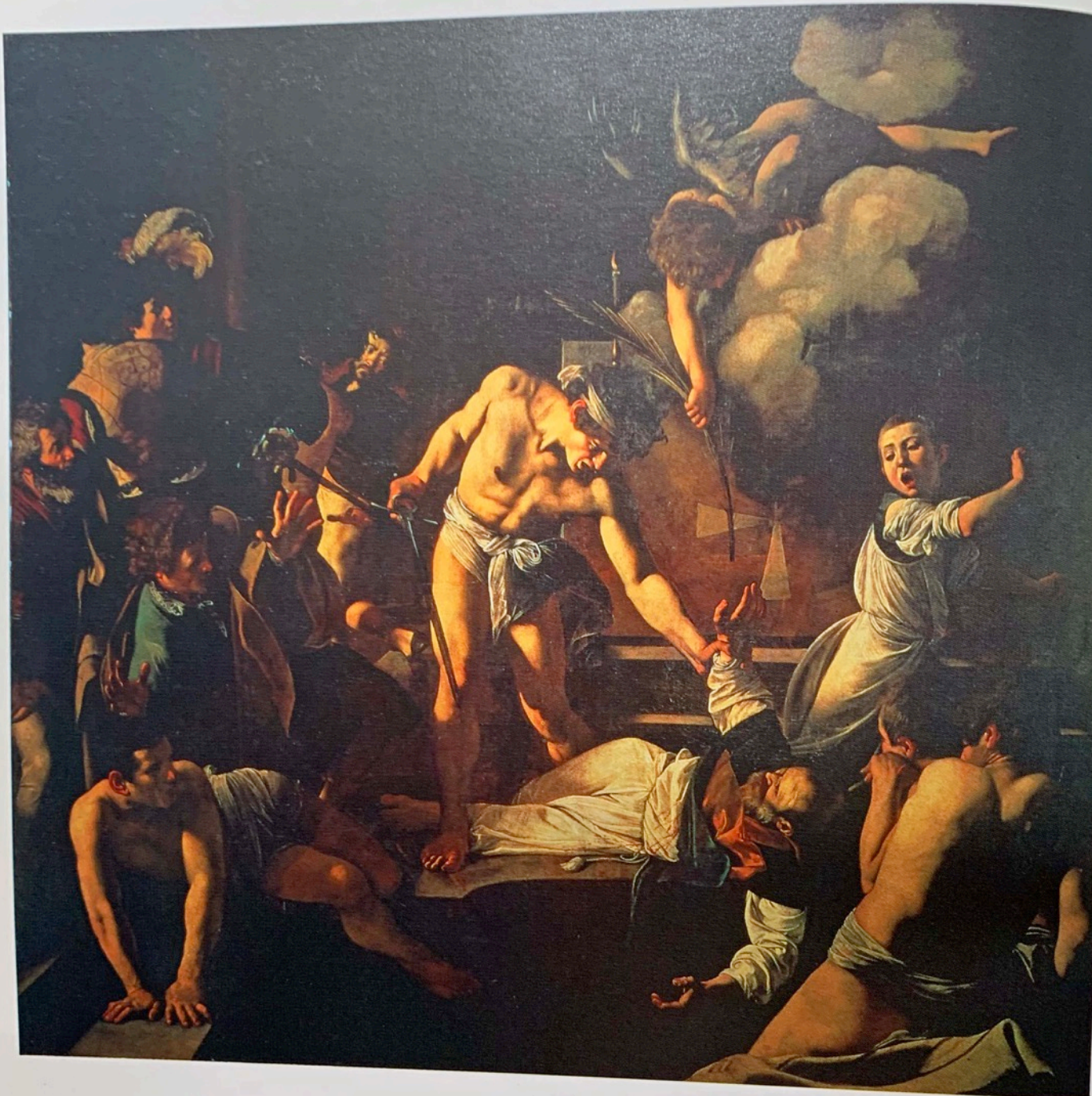
Plate 4 CARAVAGGIO The Martyrdom of Saint Matthew (1599–1600) Oil on canvas, 10 ft. 7½ in. × 11 ft. 3 in. Church of San Luigi dei Francesi, Rome