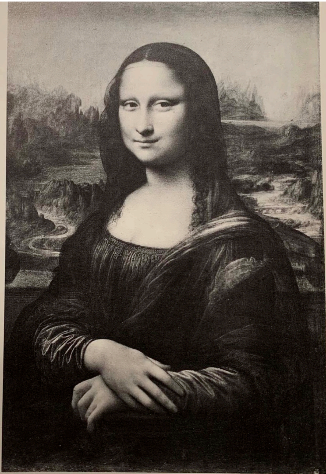
Figure 3 LEONARDO DA VINCI Mona Lisa (c. 1503–05) Oil on panel, 30¼ × 21 in. Musée du Louvre, Paris