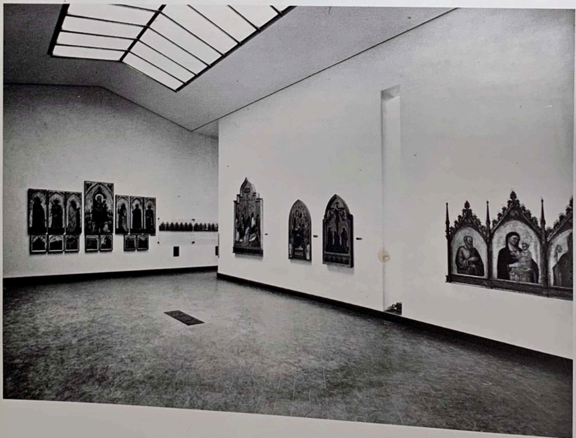
Figure 4 Opening rooms Galleria degli Uffizi, Florence