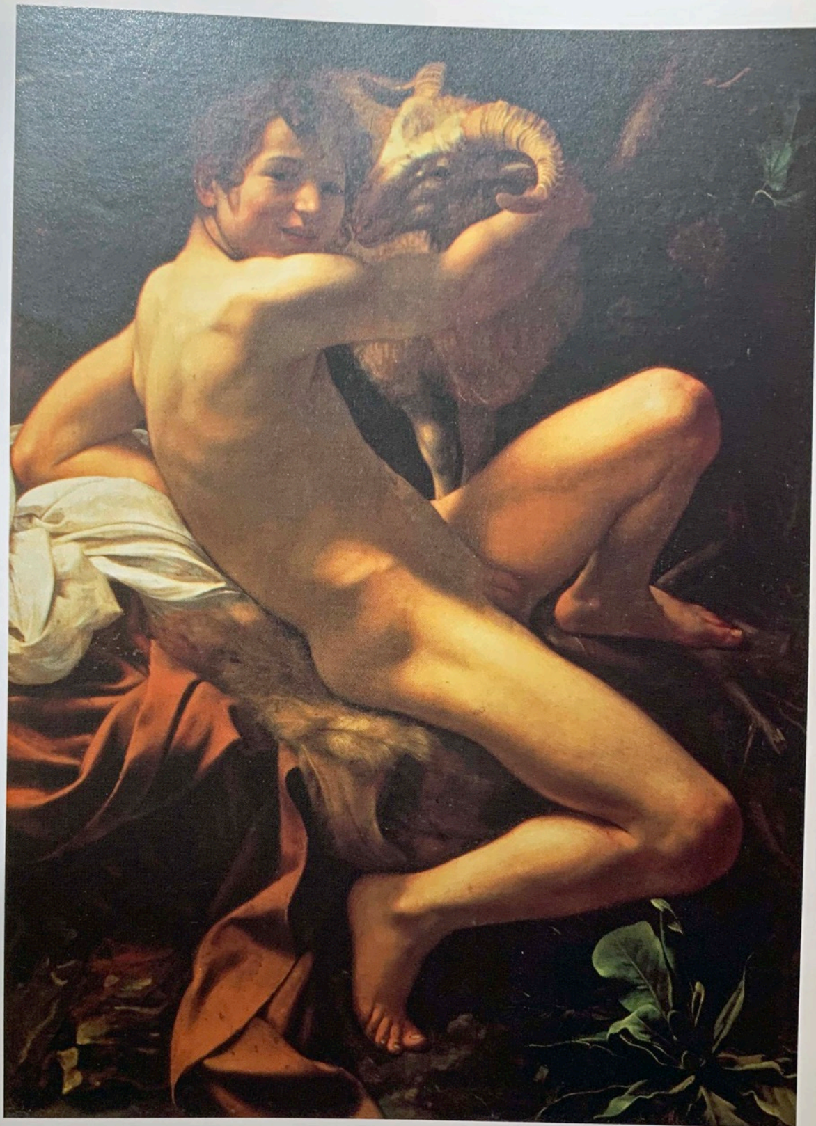
Plate 3 CARAVAGGIO Saint John the Baptist (c. 1602–03) Oil on canvas, 52 × 38¼ in. Capitoline Museum, Rome